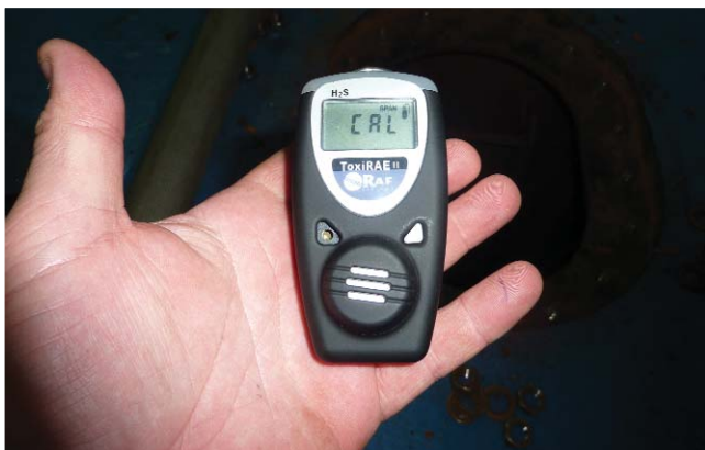
PORTABLE HAND HELD O 2 METRE

Additionally, the H 2 S meter had not been calibrated. There was no O 2 meter on board.